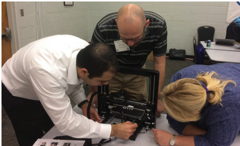
Fig. 1. A diverse group of AM studio participants builds a 3D Printer

The majority of the studio-type innovative AM workforce activities are reported in Maker Space practices. Some papers reported the innovations made in home institutions' maker spaces in providing an efficient and effective learning environment [30,31]. Figure 1 shows a team of participants building a 3D Printer in an AM Studio organized by Tennessee Technological University and Edmonds College.