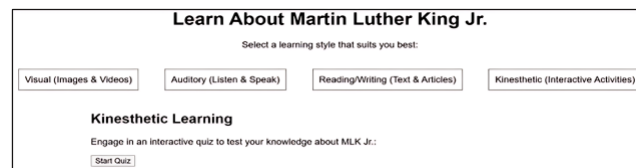
Fig. 1. Results of an AI prompt using ChatGPT to create a VARK learning model for students to use based on their preferences. Based on the students' selection, the lesson plan will be presented with the desired modality to foster improved learning and retention.

In this section, resulting visualizations depicting a few basic AI tools & techniques will be shown. While these tools and associated techniques continue to advance at a rapid pace, below are four implementation use cases that can be adopted by educators to teach specific topics to facilitate VARK learning styles.